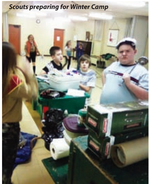
Scouts preparing for Winter Camp

Plans are in the works for our Annual Faith camp where ALLL sections of Scouting go to Camp Impeesa for the weekend