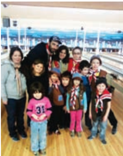
The Beaver section went bowling the night they couldn't meet in the church because of the heating issue. They had a 'ball!'

Our Leaders are providing a wide range of activities for the youth to experience. Library, Police Station, Bowling, Leadership training and Winter Camp. Even while they are having fun, they are earning badges to better prepare them for the road to what life has to offer them.