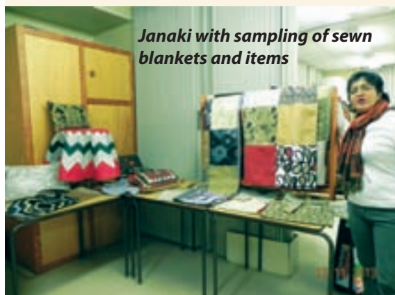
Janaki with sampling of sewn blankets and items