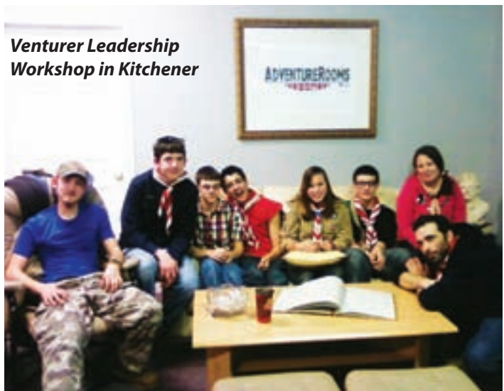
Venturer Leadership Workshop in Kitchener