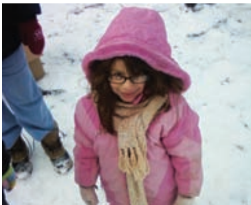
A youth from our group at the Area Beaver Bur-r-r where 20th Faith hosted the event of fun winter game activities.