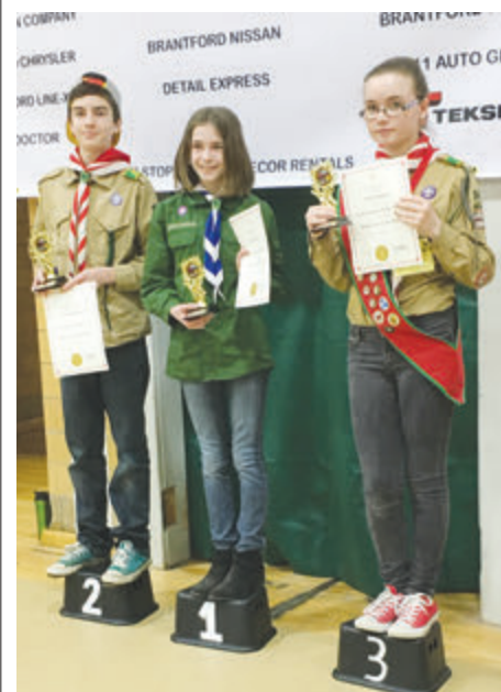
Brant Area Rally Scout Truck Winners!

Gearing up for our Annual All Section Faith Camp in April at