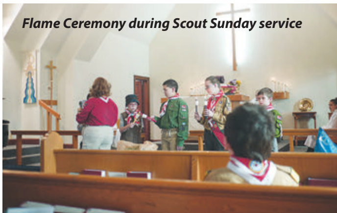
Flame Ceremony during Scout Sunday service