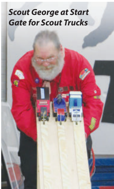
Scout George at Start Gate for Scout Trucks