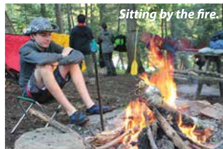
Sitting by the fire.