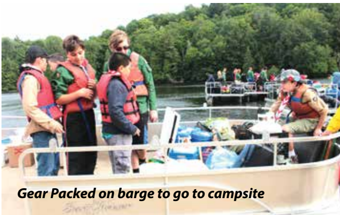
Gear Packed on barge to go to campsite

Pink Panther Sub-Camp September 22-24th at Camp Bel in Dorchester. We are part of the Brant Contingent of 4 Cub Packs attending.