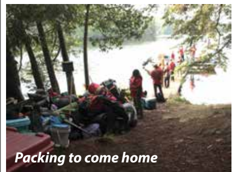
Packing to come home