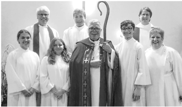
Reformation Service Worship Leaders