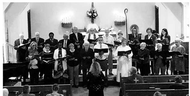
Reformation Mass Choir